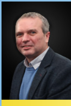
RAY STAPLETON COMMUNITY SECTOR