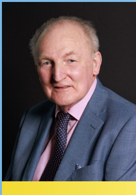
WILLIAM O'DONOVAN COMMUNITY SECTOR