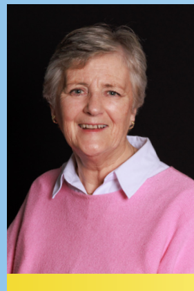
MARY O'CONNOR COMMUNITY SECTOR