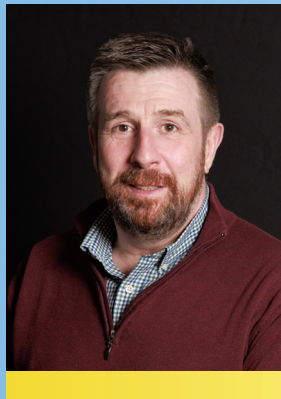
PAT KIDNEY COMMUNITY SECTOR